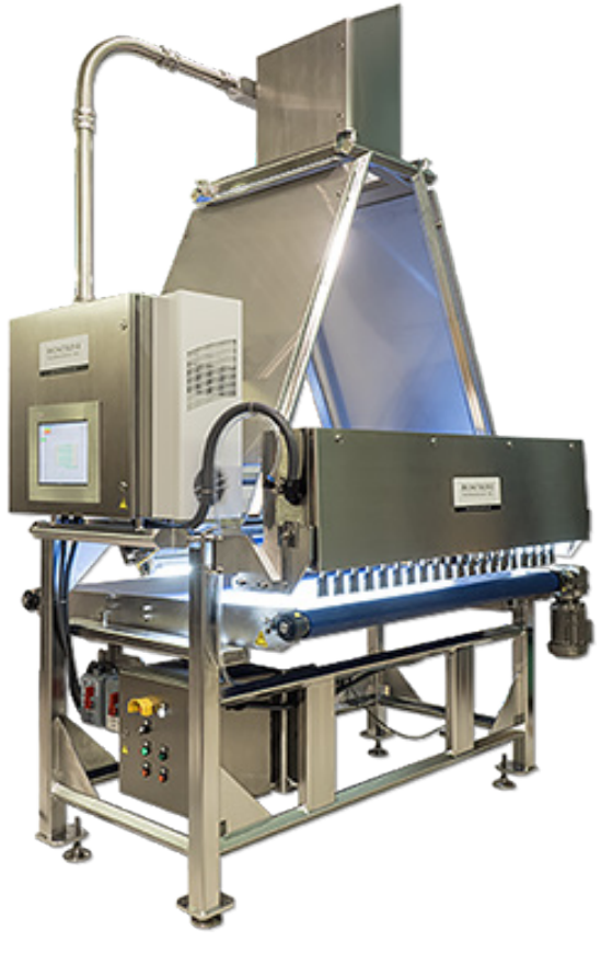
MT24 Pizza Inspection System