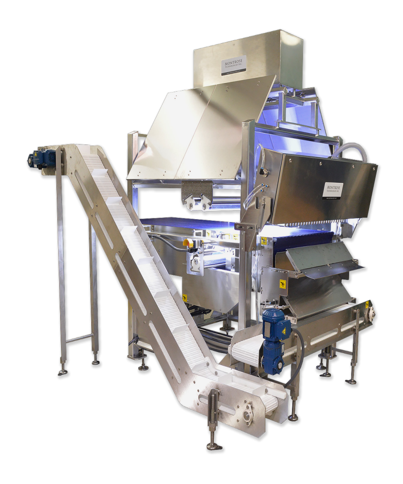
MT-36 In-line Inspection Systems for Bagels